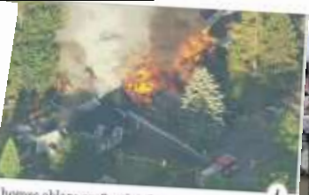
homes ablaze on South Whidbey Island